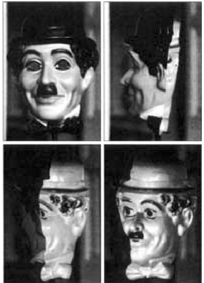
Fig 1 Hollow mask. The hollow inside of the mask seems to be a normal face with a nose sticking out. For the positions and shapes of the eyes and mouth and so on, call up the brain's hypothesis of a face, which past knowledge says is sticking out. This is how the hollow mask appears, though we know that the perception is false. This shows the modularity of brain and mind. Perceptual and conceptual hypotheses may disagree when brain communication is lacking. [REF 3]

From patterns of stimulation at the eyes and ears and the other organs of senses, including touch, we project sensations of consciousness into the external world. Although this is a startling thought, the experience of projecting afferent reality from the eyes is familiar in visual after-images. Try looking at a bright light, then at a surface such as wall. You see the pattern that is photographed on the retina from the flash as outside the eye, as being on the wall. The more distant the surface the larger it appears, though of course the retinal photograph is unchanged. This startling notion that perception is projecting brain-hypotheses outwards into the physical world—endowing the world with colour and sound and meaning—has surprising implications.